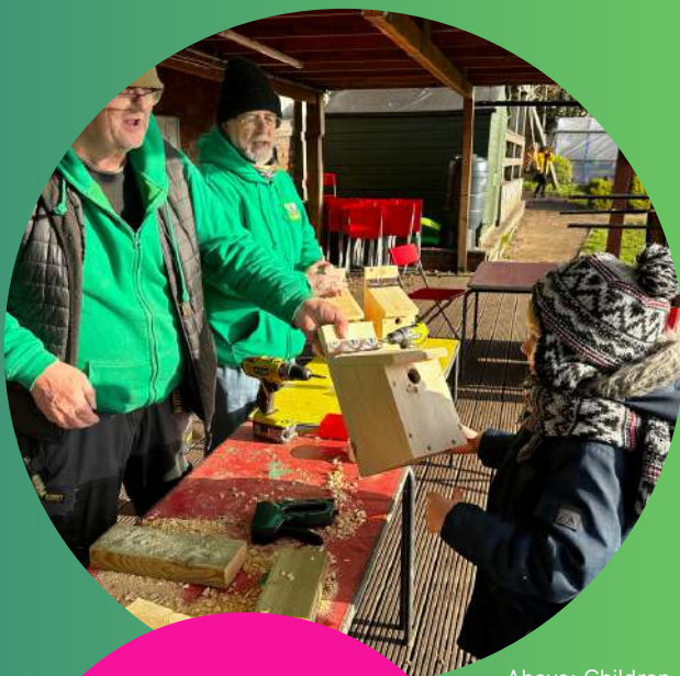
Above: Children making bird boxes at Caldmore Community Garden, Walsall

Another participant who took part in the project in the last twelve months said: "This place is an absolute lifesaver for us. I don't know how we'd have continued with our home education without it. Invaluable events, activities, meeting others, a beautiful space!"