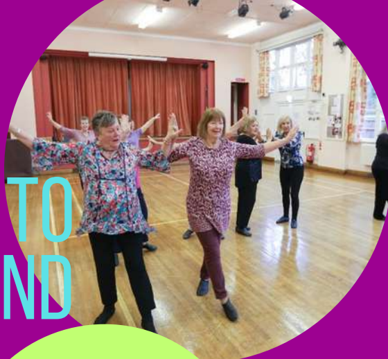
Above: Residents taking part in a session delivered by Xpress-Yourself Dance CIC.